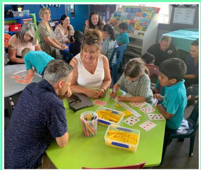
The Learner First - Maths workshop.