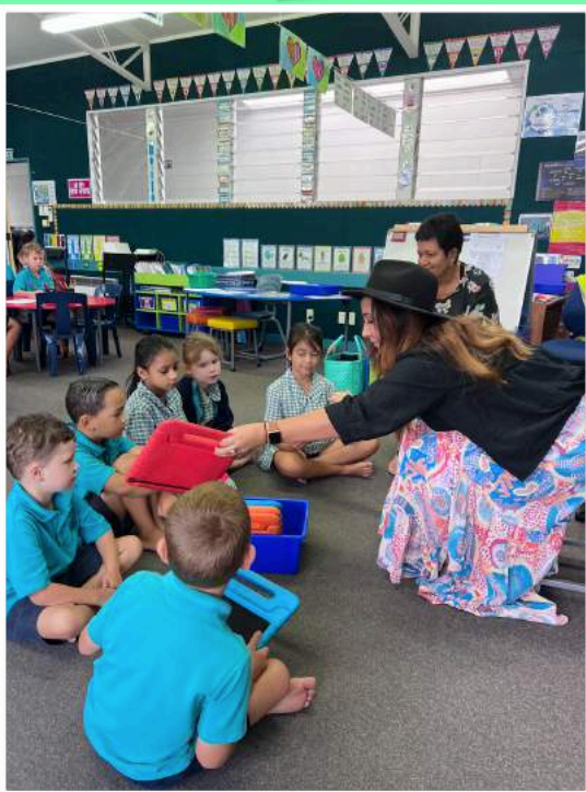
Digital Circus - Technology workshops.