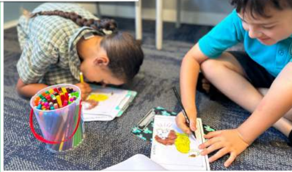
Learning Support Room