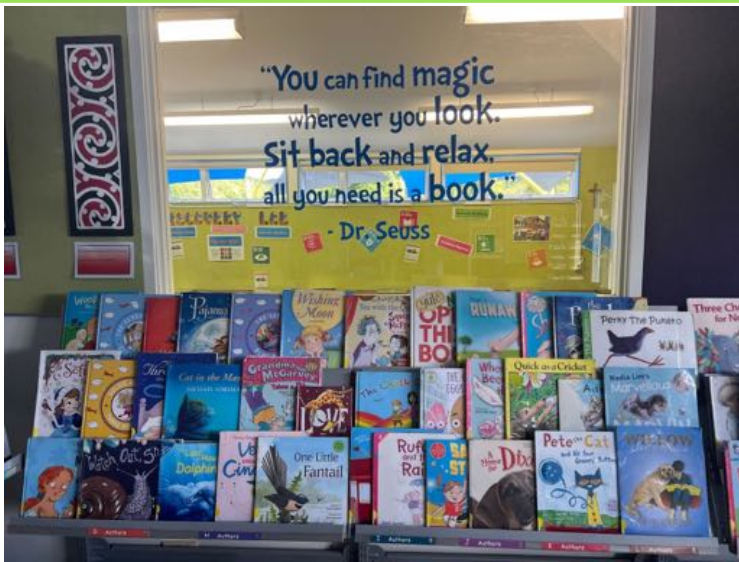
Kia ora from the Library!

We've had a great start to the year with over 4,000 books issued! It is wonderful to see that children still love reading books despite how much technology is available to them. Graphic novels have become increasingly popular and we continue to build on that section.